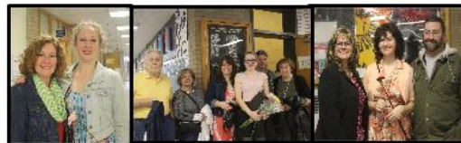
The 23 inductees and their families beam proudly after the NHS Ceremony last Wednesday, March 25 th. Congratulations!