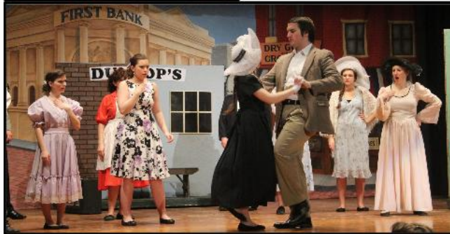
The Falcon Playhouse lights up the auditorium with their marvelous rendition of Meredith Willson's The Music Man .

Last weekend, Harold Hill's marching band arrived at Fairless High School. The Falcon Playhouse presented The Music Man four times over the weekend. The classic musical had audiences tapping along as the cast marched to "Seventy-Six Trombones" and sang to "Iowa Stubborn."